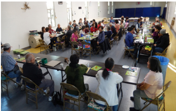
ABOVE: SG Nikkei Seniors Bingo time.