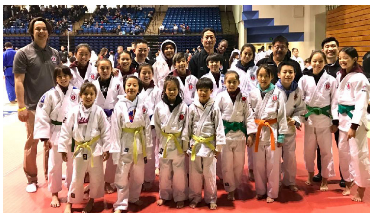
TOP LEFT: Bow in at the San Jose Buddhist Sensei Memorial Judo Championships. RIGHT: Team Picture at the Nanka West Coast Invitational, Westminster, CA. MIDDLE: IJF Referee Seminar in Doha, Qatar. BOTTOM: Team picture at the San Jose Buddhist Sensei Memorial Judo Championships.