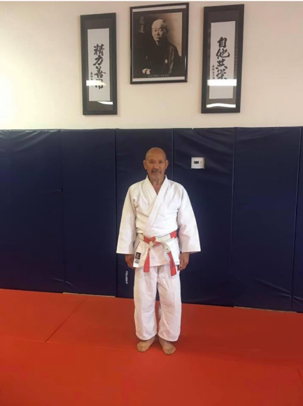
RIGHT: Hiraoka Sensei at the 2019 Riverside Women's Fight for a Cure Tournament. BELOW: Hiraoka Sensei at Riverside Judo Dojo.

ONORE WO TSUKUSHITE NARU WO MATSU - do your best and await the result.