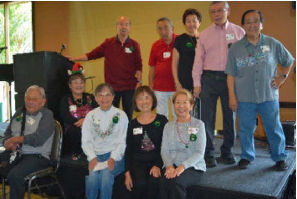
ABOVE: SG Nikkei Seniors Incoming 2020 Board. RIGHT: 2019 Nikkei Seniors Christmas Party

Merry Christmas and Happy New Year! from the San Gabriel Nikkei Seniors