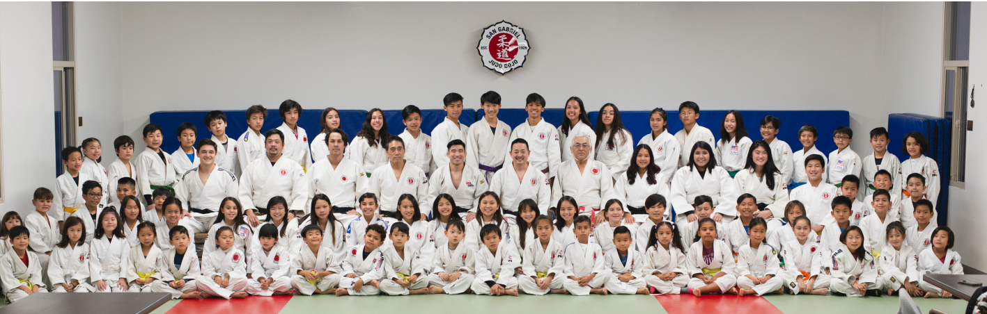
ABOVE: 2019 San Gabriel Judo Dojo Holiday Party. BELOW: Receipents of the Holiday Party Year-End Awards.