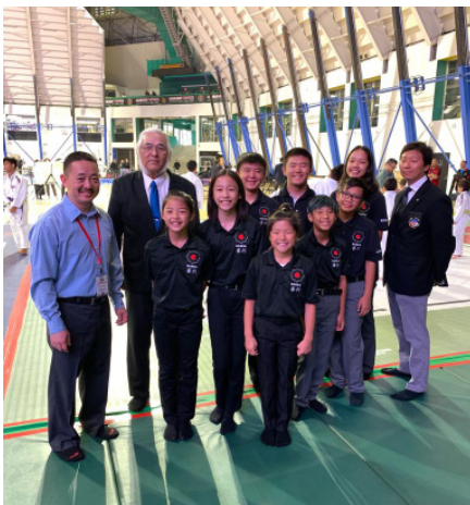
Left: San Gabriel Judo's Junior Referees at 2019 Nikkei Games. Bottom: San Gabriel Judo and Harbor Judo at the 2019 Nisei Week Grand Parade.