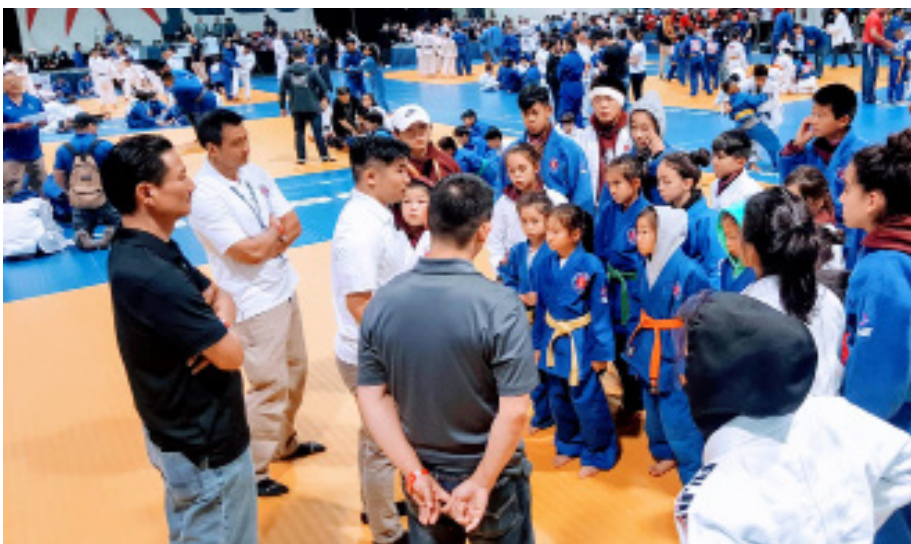
2019 USA Judo National and International Junior Olympics, Anaheim, California.