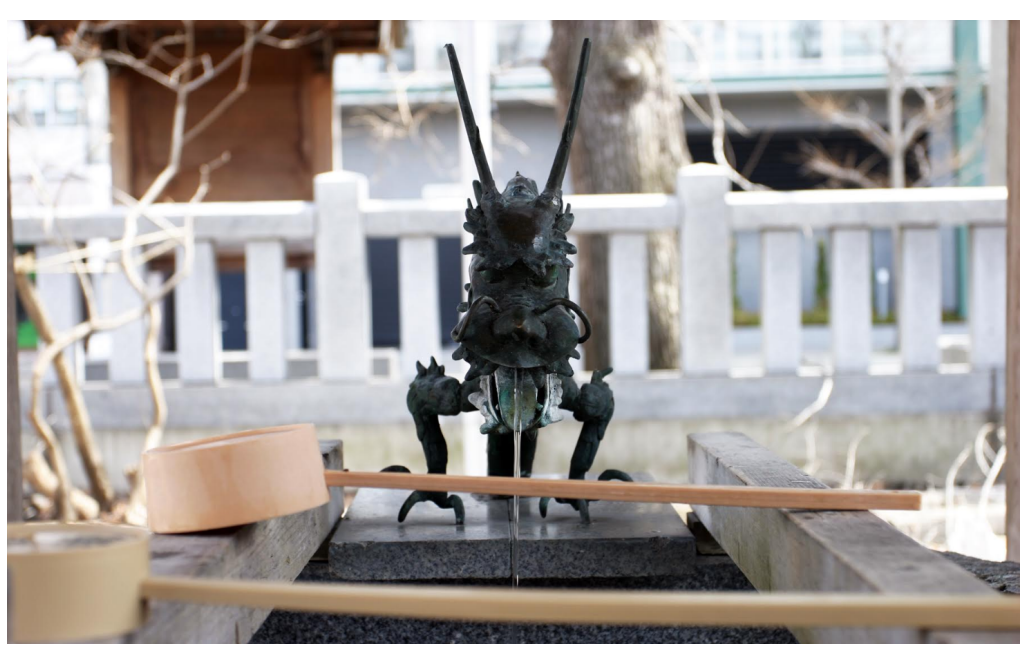
Shinto shrine purification water (temizu). Sapporo, 2010.