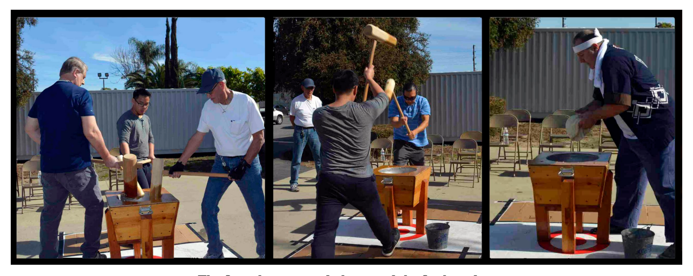
The first phase, second phase, and the final product

Mochi tsuki is the pounding of short grain glutinous sweet rice (mochigome) into large confectionary rice cakes (kagami mochi), medium size confectionary rice cakes (komochi), and small confectionary rice balls (dango mochi). Mochi cakes can be eaten fresh, or boiled at a later date inside New Year soup, warmed up and eaten with various toppings, or filled with some type of filling (mochigashi). The mochi rice is steamed then pounded or crushed repeatedly while inside a large mortar (usu) using one or more pestle (kine) until all the lumps are crushed out. Once the rice takes on a sticky consistency, soft mochi is next formed into the desired size and type.