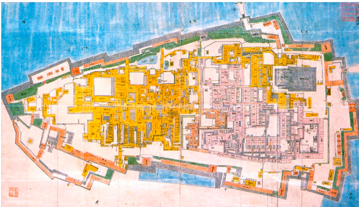
Edo-jo Honmaru , ca. 1659. From left to right: the orange areas are the palace Ō-omote and Naka-oku ; the pink areas are the palace Ō-oku ; and the black square in the top right area is the castle Tenshu .

In any event, The Edo-jo Main Castle ( Tenshu ) was destroyed in 1657, and the Main Palace ( Honmaru Goten ) was destroyed in 1863. While neither were reconstructed, in 1868 the Main Inner Citadel ( Honmaru ) was modified and built into what is now the Imperial Palace of the Emperor ( Kōkyō ), located in the Chiyoda ward of Tokyo. The Imperial Palace has a dedicated martial art dojo called the " Saineikan Dojo ", where primarily judo and kendo are now taught to the Imperial Guards ( Konoe ). The subject of Daito-ryu Oshikiuchi is rather deep, so I will write more about it in the next newsletter.