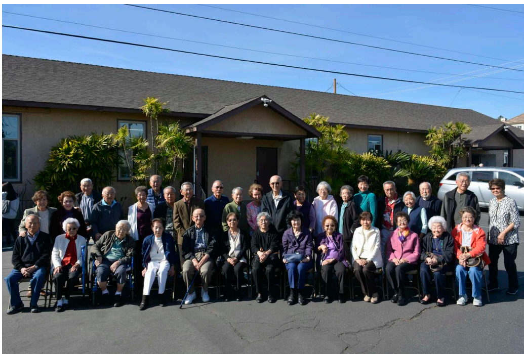
Attendees at the 25th Anniversary Celebration