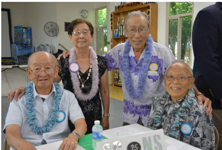
Invitation to 25th Anniversary Celebration.